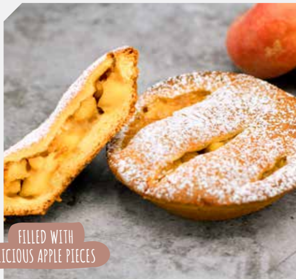
FILLED WITH DELICIOUS APPLE PIECES