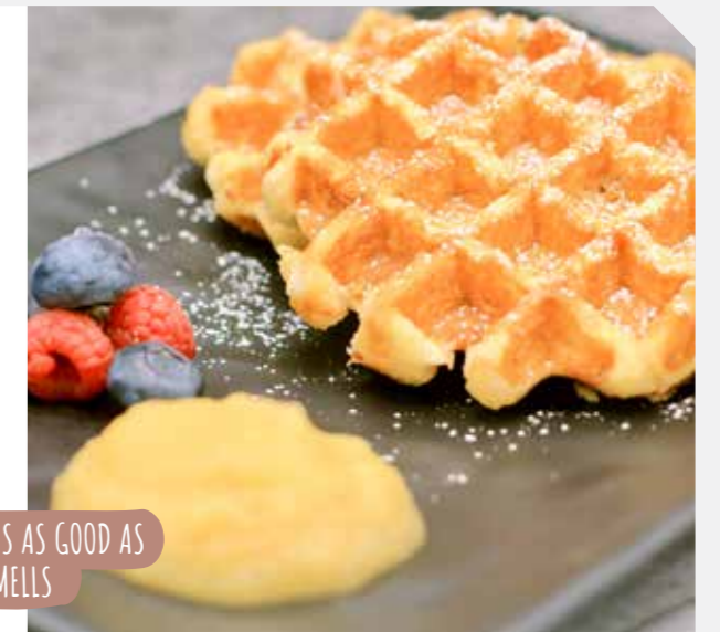
IT TASTES AS GOOD AS IT SMELLS