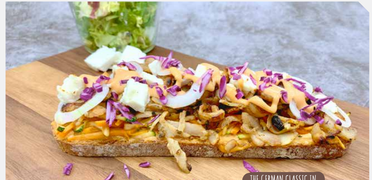
THE GERMAN CLASSIC IN A VARIETY OF FORMS