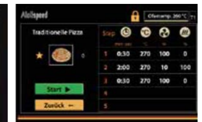
AS300Hplus AS300HBplus AS300H Easy AS400H AS400HB